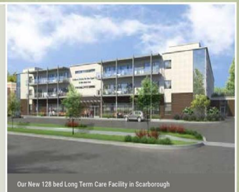
Our New 128 bed Long Term Care Facility in Scarborough