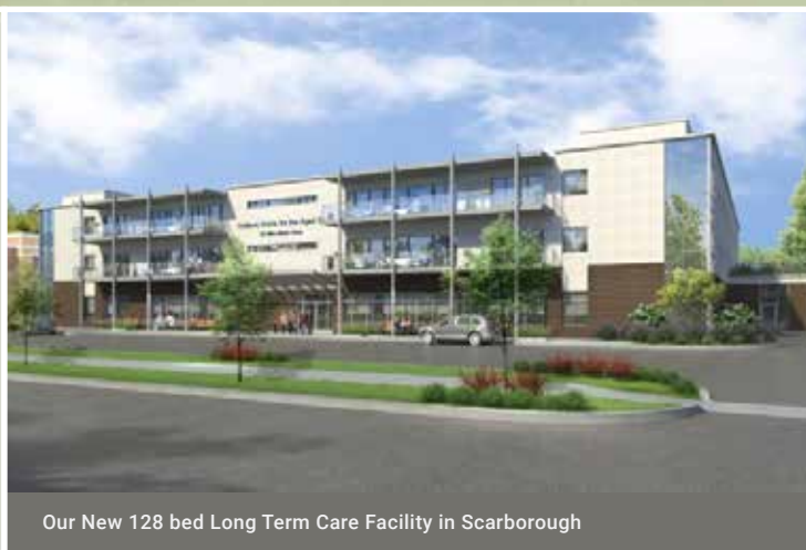
Our New 128 bed Long Term Care Facility in Scarborough